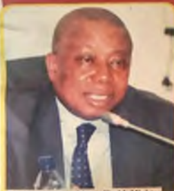
Evans Agbenyegbe-Manu, Health Minister