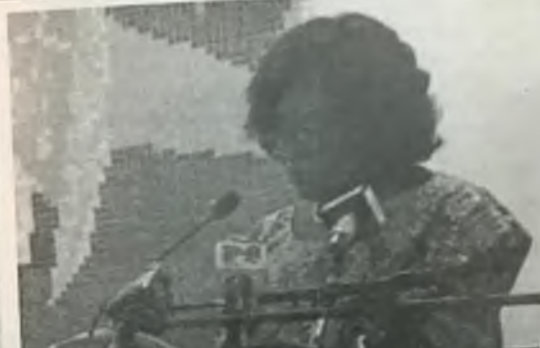
Gifty Twum Ampofo, Deputy Minister of Gender, Children and Social Protection

on the stakeholders to forge a strong alliance within the West African sub-region to effectively fight the aforementioned crimes which threatened their security and stability.